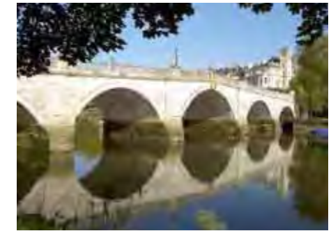
Richmond Bridge, built in the 1770s and still a vital link across the river

The bridge was lowered slightly and widened in 1939, very skilfully. The work is almost impossible to see unless you look very carefully at the undersides of the arches.