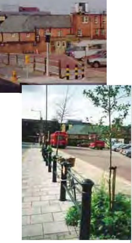
Richmond bus station before (top) and after (bottom) the Environment Trust took action, with London Transport and the local council, to make the place more inviting for passengers and pedestrians

My one regret was that, although we had managed to buy the 17th-century Rose House in Barnes High Street to be a community centre for the BCA and its many groups and activities, we had not also bought the builders' yard alongside. For what we got there were luxury houses, and what we