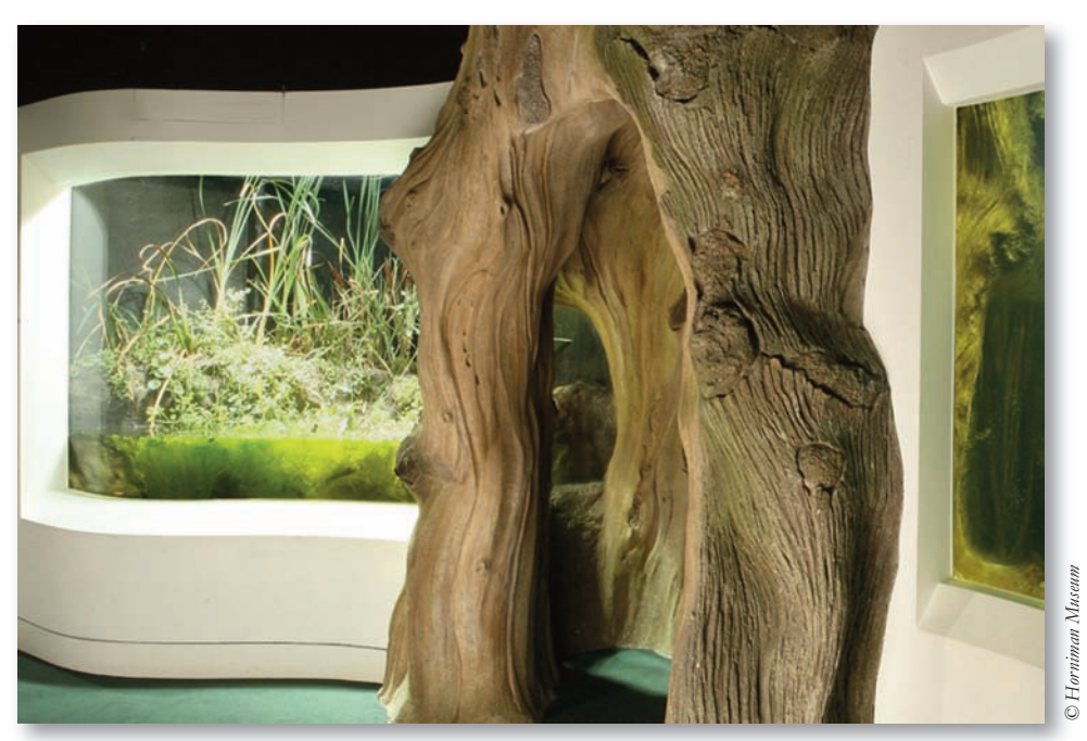
The River Centre's aquarium, like this one at the Horniman Museum, will let people see the life teeming within the Thames